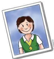
Photo Retakes: Retakes will take place Wednesday, October 18 . Please make sure your child picks up a retake envelope at the office if you would like retakes. All orders and payment must be handed into the photographer that day. Do not send retake forms or payment to the school office.